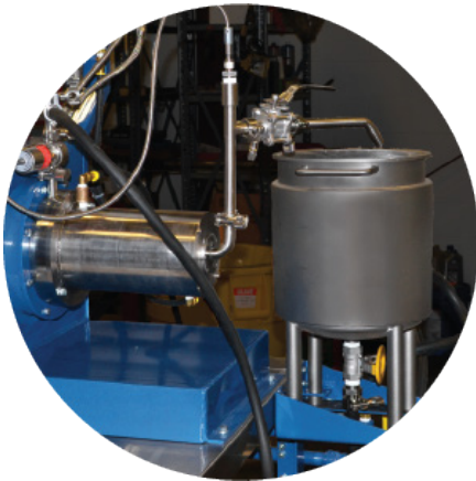
Optional Feed Tank