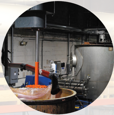
Large Batch Production