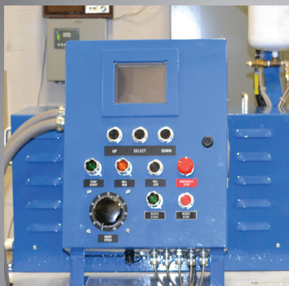
"SMART" HMI style PLC Control Package – available in explosion-proof or dust tight control consoles