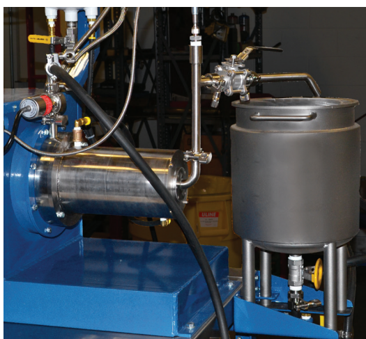
Optional Feed Tank

One advantage of the SMP-1.5 is its ability to produce data that is directly scalable to your larger production size CMC mills. CMC's mill chambers are designed with the same length to diameter ratio making it possible for an accurate scale up.