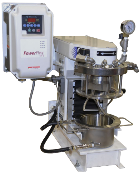
Model DP-.05 w/ Glass Hood

Custom Milling & Consulting LLC's line of high quality Double Planetary Mixers provide faster mixing cycles and better dispersion when compared to traditional planetary mixers. CMC's robust design allows for the processing of the most stringent, high viscosity materials time and time again.