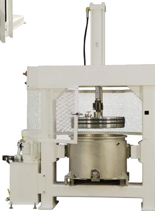
Model DP-150 Ram Press